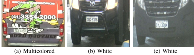
Fig. 5. Examples of images excluded due to vehicles with multiple colors (a) and those partially outside the image frame (b, c). The colors of the vehicles in (b) and (c) cannot be visually determined solely from their front bumpers. Note that the vehicle images in this figure were resized for improved visibility.

The final selection process involved removing 83 images that lacked identifiable colors. This was mainly observed (i) when vehicles were heavily occluded or substantially outside the image frame; and (ii) when vehicles are registered as “multicolored” 4 (a rare occurrence). Fig. 5 provides examples of images excluded during this selection process.