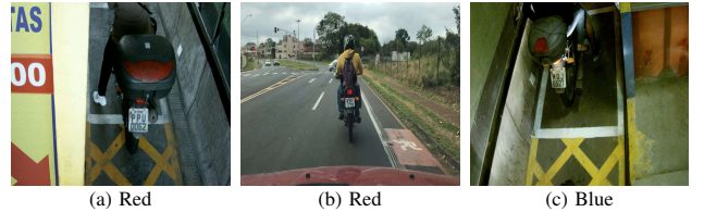
Fig. 4. Examples of discarded motorcycle images: (a) and (c) were sourced from the RodoSol-ALPR dataset [15], while (b) was extracted from the UFPR-ALPR dataset [18]. Below each image is the corresponding motorcycle's color. In this figure, the original images were slightly resized for better viewing.

After preprocessing, a total of 28,061 images were obtained. However, another filtering process was necessary to ensure that every image in the UFPR-VCR dataset is suitable for the VCR task. This involved discarding 10,870 motorcycle images from UFPR-ALPR (870) and RodoSol-ALPR (10,000), as these images represent scenarios where identifying the vehicle color was nearly impossible (see three examples in Fig. 4).