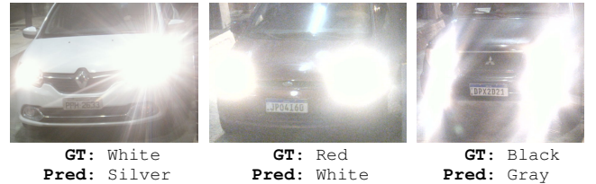
Fig. 7. Examples of nighttime images that were misclassified.

Our analysis uncovered an interesting trend: nighttime images were misclassified at a much higher rate than daytime images. Specifically, 72 out of 222 misclassified images (32.4%) were captured at night. Nighttime images likely constitute less than 10% of the UFPR-VCR dataset, although the exact percentage is unknown as capture times are not labeled in the original datasets. This discrepancy is likely due to the inherent challenges of nighttime scenes, such as high illumination and overexposure from vehicle headlights (see Fig. 7). The causes behind the remaining misclassifications were less apparent.