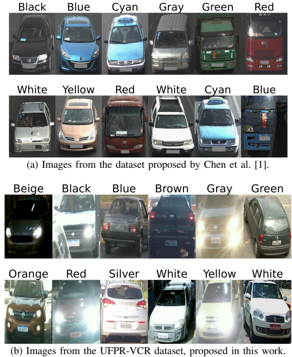
Fig. 1. Examples of images from the datasets proposed in [1] (a) and in this work (b), with the corresponding vehicle color annotation shown above each image. Observe that images in the proposed dataset (b) depict significantly more challenging scenes than those in (a), featuring adverse conditions such as nighttime settings and vehicles from various viewpoints.

Despite these conditions, studies have reported satisfactory outcomes, achieving up to 95% average accuracy in color recognition across the mentioned dataset and datasets with similar characteristics [2]–[4], [6]. However, upon analyzing these studies, it becomes evident that the explored datasets