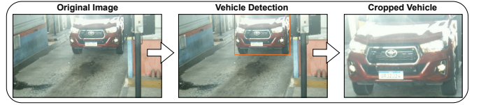
Fig. 3. Illustration depicting the process of extracting vehicle patches from images in the RodoSol-ALPR dataset, which lacks vehicle position labels.

no noise removal or image enhancement techniques were applied to preserve the original adverse image conditions.